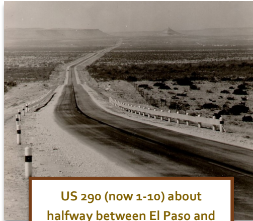
US 290 (now 1-10) about halfway between El Paso and San Antonio, circa 1960.

“Road Trip Cursillos”, they were able to arrange for the Movement spread to Arizona.