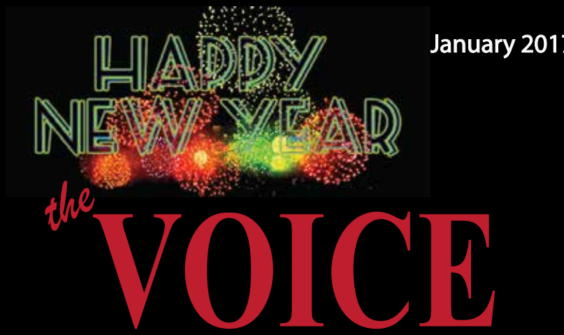
Newsletter for the Cursillo Movement of the Diocese of Phoenix